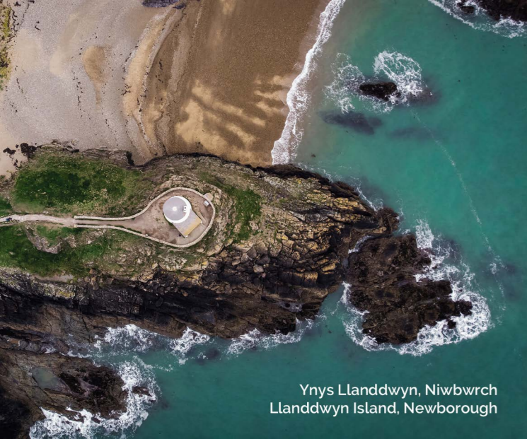
Ynys Llanddwyn, Niwbwrch Llanddwyn Island, Newborough