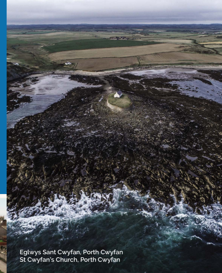
Eglwys Sant Cwyfan, Porth Cwyfan St Cwyfan's Church, Porth Cwyfan