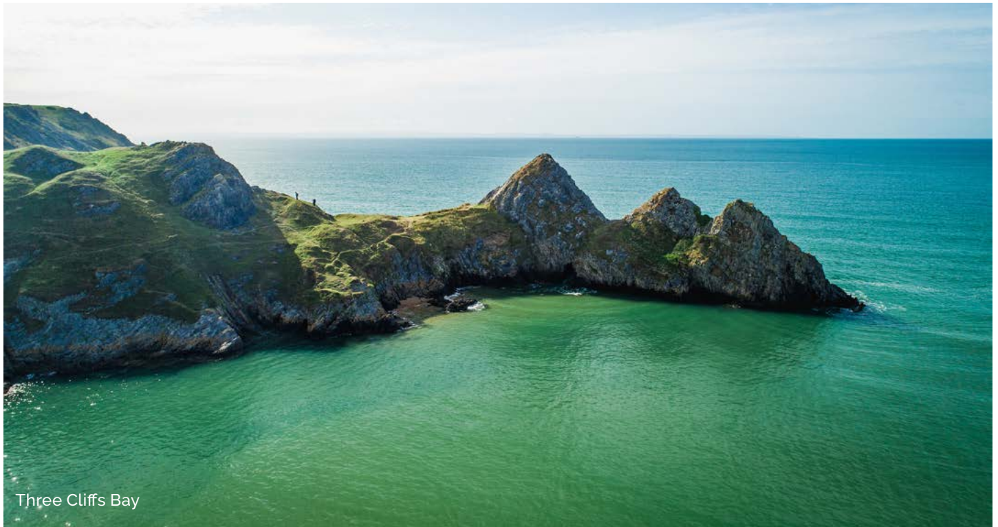
Three Cliffs Bay