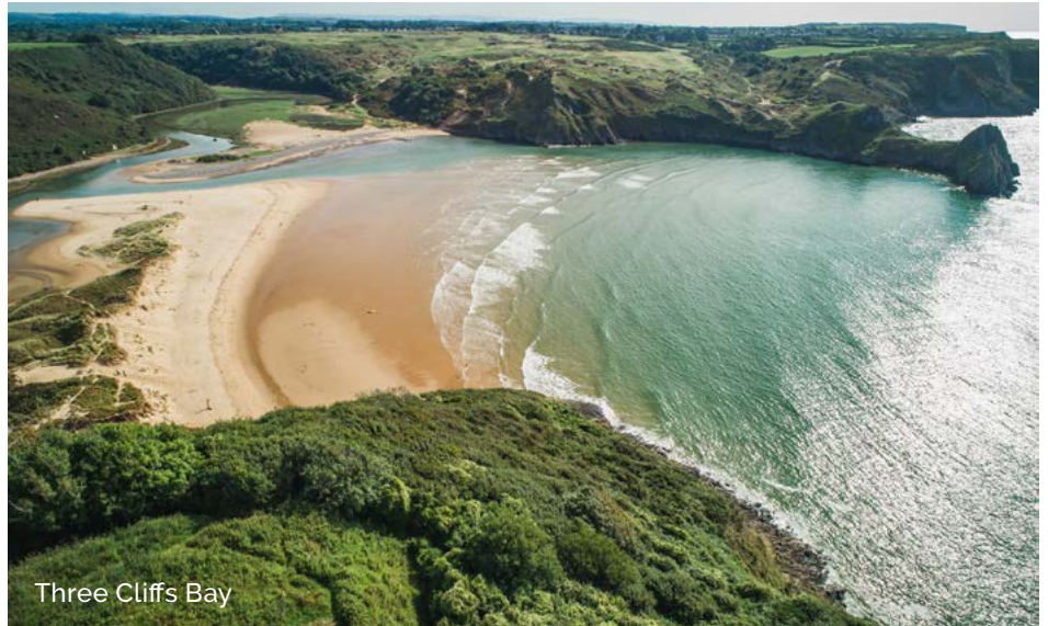
Three Cliffs Bay