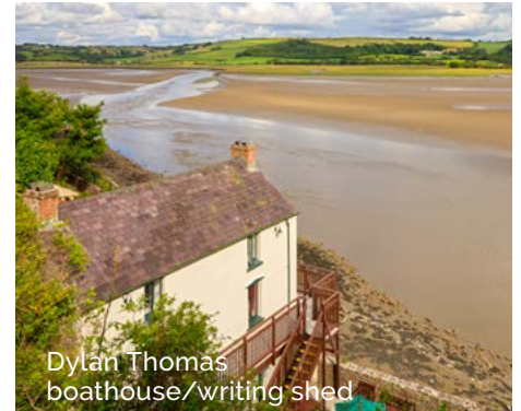
Dylan Thomas boathouse/writing shed